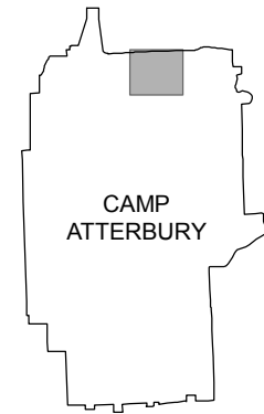
Index map highlighting the location of the Cantonment Area with respect to the Camp Atterbury boundary.